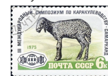
Karakul lamb postage stamp, Soviet Union, 1975

Op Vakansie Boerderij flock.