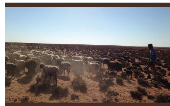
Floris Kotze follows a newborn Karakul lamb in the Bushmanland, a traditional sheep farming area in South Africa.