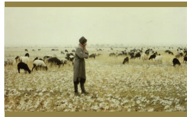
Shepherd with Karakuls outside Samarkand, Uzbekistan, 1987 Peace Fleece Trip

These sheep have been raised, studied, and celebrated around the world.